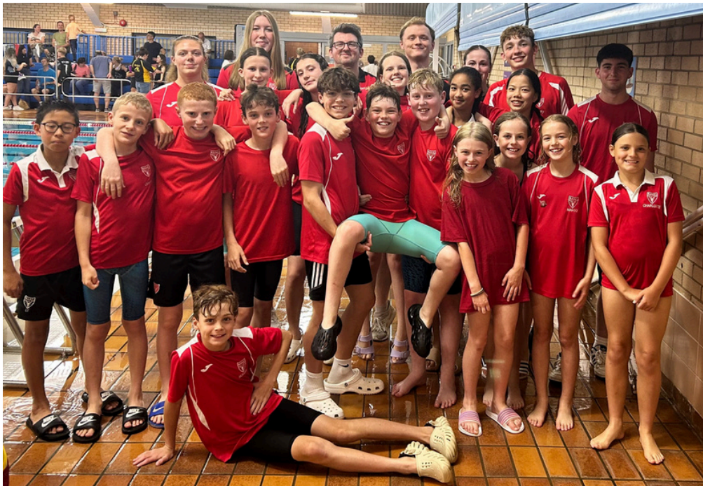
The 2024 Peanuts League team

For many swimmers, this will be the first team swimming event they have entered.